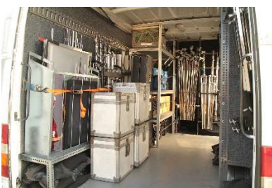
Sprinter 2500 with room for extra G&E & camera support