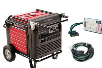
Honda EU6500is generator