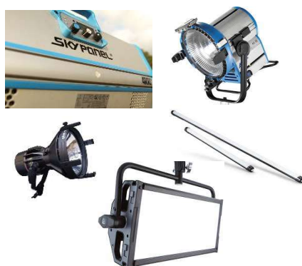
Arri SkyPanel, M-18, Quasar Science, LitePanels, K5600,...