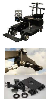
Camera dollies & cranes